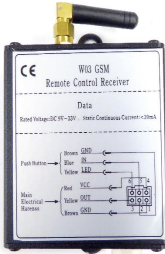
SIM Module Receiver