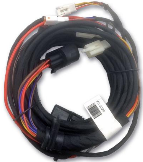
3A) Wiring Loom Connections