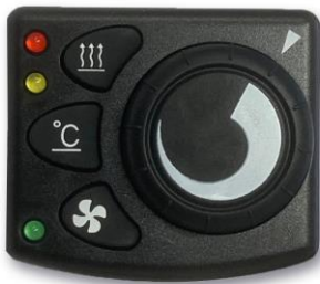
2A) Rotary Control Connections